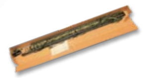
POULTRY NETTING GATE SYSTEM (AA-NET/GATE)