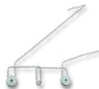
TRIPLE ANTI-DIG FENCING OFFSET BRACKET [EY-OAD]