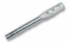
WIRE TWIST TOOL (TL-WTT)