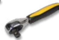
HALF INCH RATCHET TENSIONER (TL-RAT1/2)