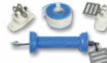
TAPE GATE HANDLE KIT (AA-GHT4)