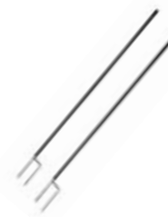
NETTING POSTS (AA-NET112/POST, AA-NET105/POST)