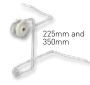
DOUBLE OR TRIPLE FENCING OFFSET BRACKET [EY-OD225, EY-OD350, EY-OT240]