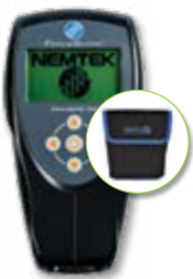
FENCE SCOPE MULTI TOOL (TL-FS) OPTIONAL POUCH (TL-FSTP)