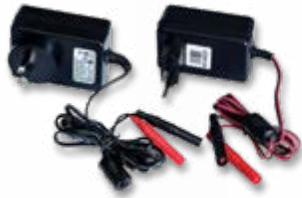
MAINS POWER ADAPTOR 12VDC (AEE-A/CHR, AEE-A/CHR/AU)