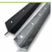
Y-PICKET POST [EY-Y15NB, EY-Y24NB, EY-Y30NB, EY-Y15NHD, EY-Y24NHD, EY-Y30NHD]