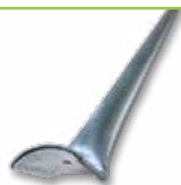
STRAINER POST STAY [EY-CSR3815HD, EY-CSR3824HD, EY-CSR5024HD, EY-CSR5030HD]