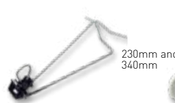
SINGLE OUTRIGGER BRACKET AND FENCING OFFSET BRACKET [AA-OUTRIGGER230, AA-OUTRIGGER340, EY-OS225, EY-OS450]