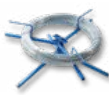
LARGE WIRE DISPENSER (EW-JENNY)