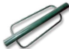
Y-PICKET POST DRIVER (TL-PDY)