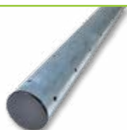
STRAINER POST END AND CORNER [EY-CPR7620HD15, EY-CPR7620HD24, EY-CPR7620HD30, EY-CPR9520HD24, EY-CPR9520HD30]