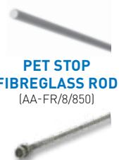
PET STOP FIBREGLASS ROD (AA-FR/8/850)