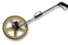
DISTANCE MEASURING WHEEL (TL-DMW)