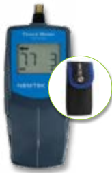
FENCE METER (TL-FM) OPTIONAL POUCH (TL-FMTP)