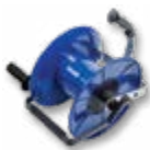
1:1 GEARED REEL HOLDER (AA-RH1)