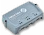
SOLAR REGULATOR - LED [SOL-REG140]