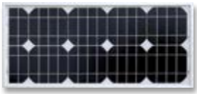
140W SOLAR PANEL [SOL-SYS140W]