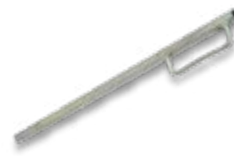
ROD DRIVER TOOL (TL-PD10R)