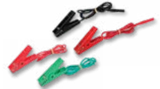
ENERGIZER CONNECTOR CLIPS (AEE-CL/BR, AEE-CL/GR)