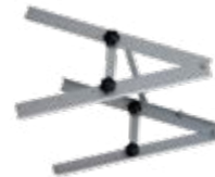
SOLAR PANEL MOUNTING BRACKET [SY-SYZ040R]