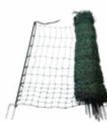
POULTRY NETTING (AA-NET112)