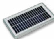
3W SOLAR PANEL (SOL-SYS3W/PS)