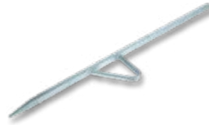
AGRI ENERGIZER TREAD-IN POST (AA-AETP)