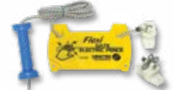
FLEXI GATE HANDLE KIT (AA-FGS/1, AA-FGS/2)