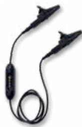
EASY FENCE TESTER (TL-EFT)