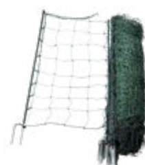
SHEEP AND GOAT NETTING (AA-NET108)