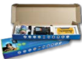
PET STOP SOLAR POWERED KIT (AA-PET/KIT)