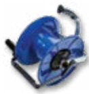
3:1 GEARED REEL HOLDER (AA-RH2)