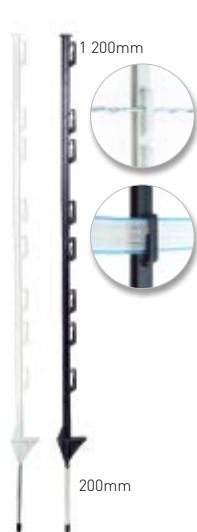
TREAD-IN POST [AA-PP/W, AA-PP/B]